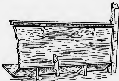
Allowing Pigs Access to Trough.

The handiness of this scheme is what recommends it. With his foot the feeder shoves the swinging partition back until it catches. After emptying the feed, he lifts the catch with his toe and the partition swings back. It is so simple that anyone can make it.