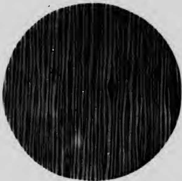
PLATE 49. LARIX AMERICANA . Tangential section from the spring wood showing the narrow ordinary rays and the rather broad fusiform rays. \times 46.8