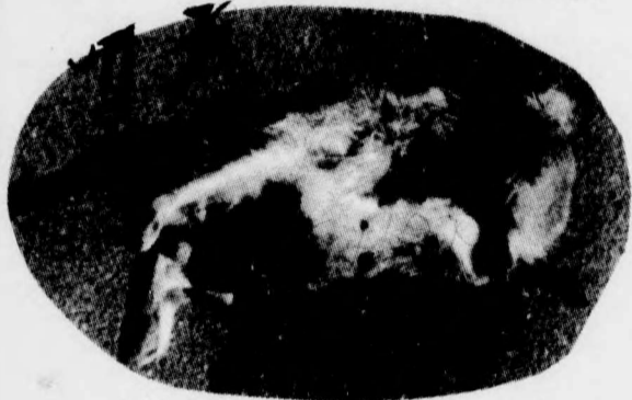
Hey Martha, what's for supper?

B lood and guts filled the highways this morning as the six official Excalibur mascot election candidates were killed in an auto accident. "It was horrible," OPP officer Scott Vermicelli exclaimed. "Road kill stew everywhere!" The candidates were returning late last night or early this morning from the campaign party in the chipmunk's blood red convertible sports camper (license plate: NUTS 2 U), when it ran into a tree. Nobody is certain why the vehicle left the road, but