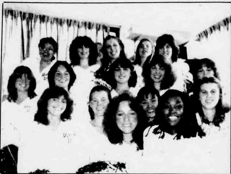
Yorkettes Pledge Full Support to Student Fund

Any donations to this Scholarship Fund could be made payable to The York Student Fund, which will put the money towards the York Malaysian and Singaporean Scholarship Fund.