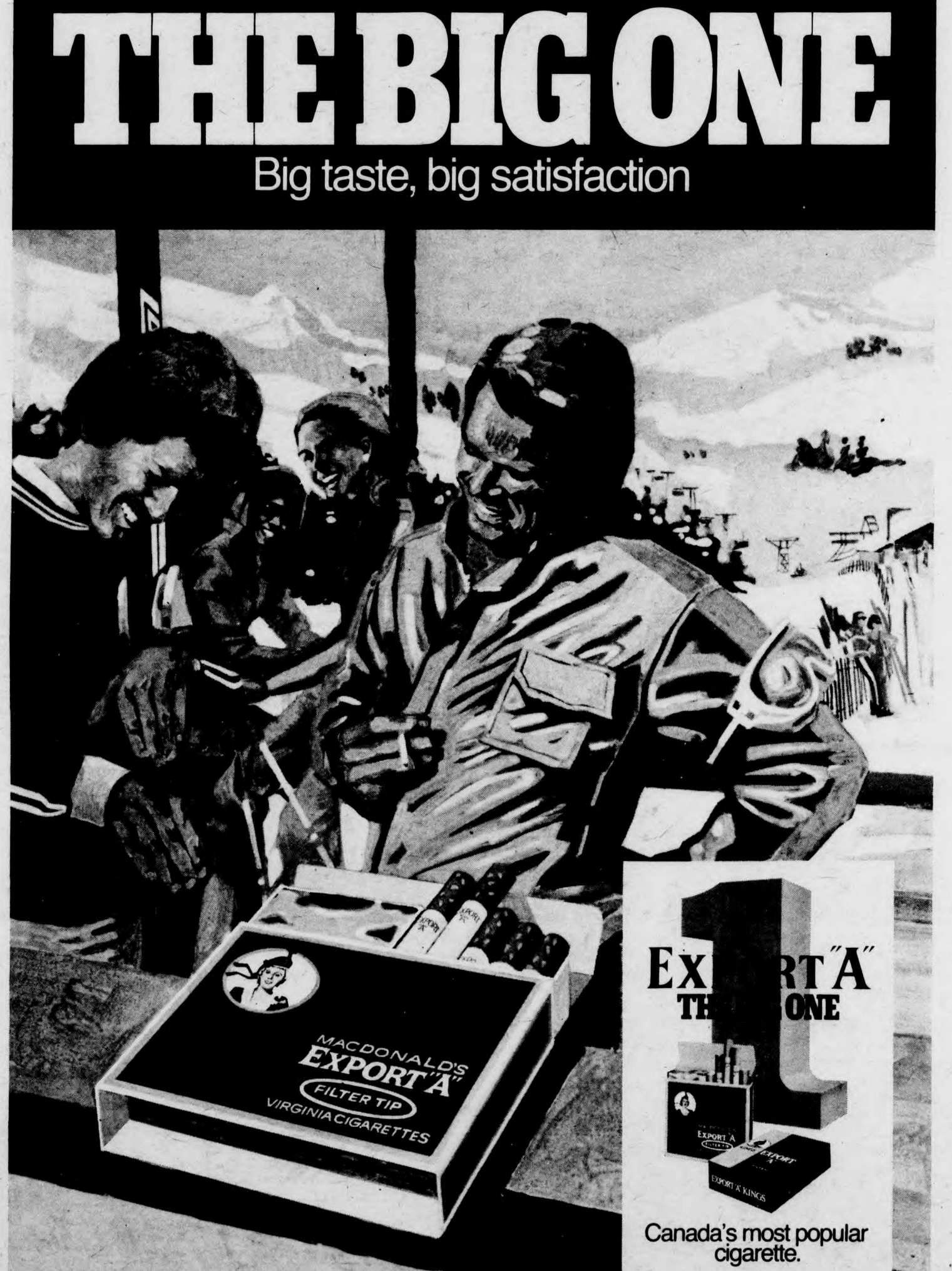
Warning: The Department of National Health and Welfare advises that danger to health increases with amount smoked.