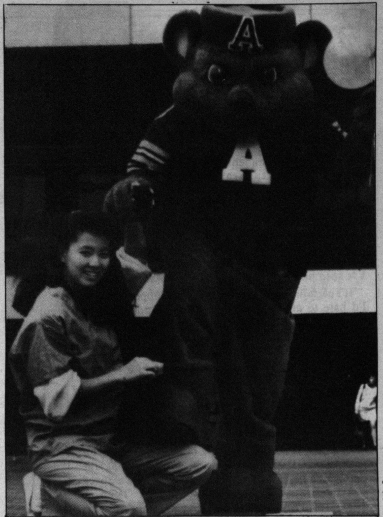
Paws for Shinerama