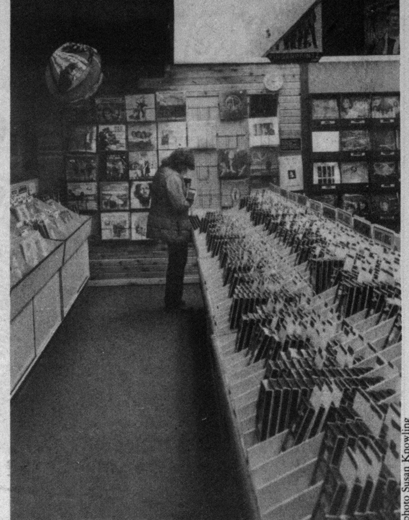
Yes. there are still some records left at the SU record store.

He adds a new campaign is essential. If customers do not know the store is open, they will not come