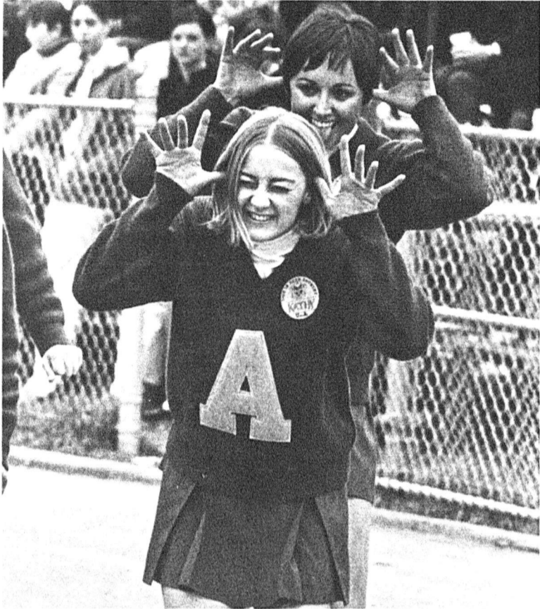
AWAY, AWAY OH EVIL SPIRITS —Bear cheerleaders will be out in force Saturday to drive away any suspicious evil spirits who might try to jinx the team.