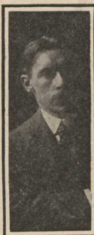
C. W. JEFFERYS

Good material is constantly pouring into THE COURIER office and subsequent numbers will contain the best of it. Photographs are arriving from all parts of the world — Japan, China, India and the Isles of the Sea. We do not want our material to be all Canadian, though the most of it must necessarily be so.