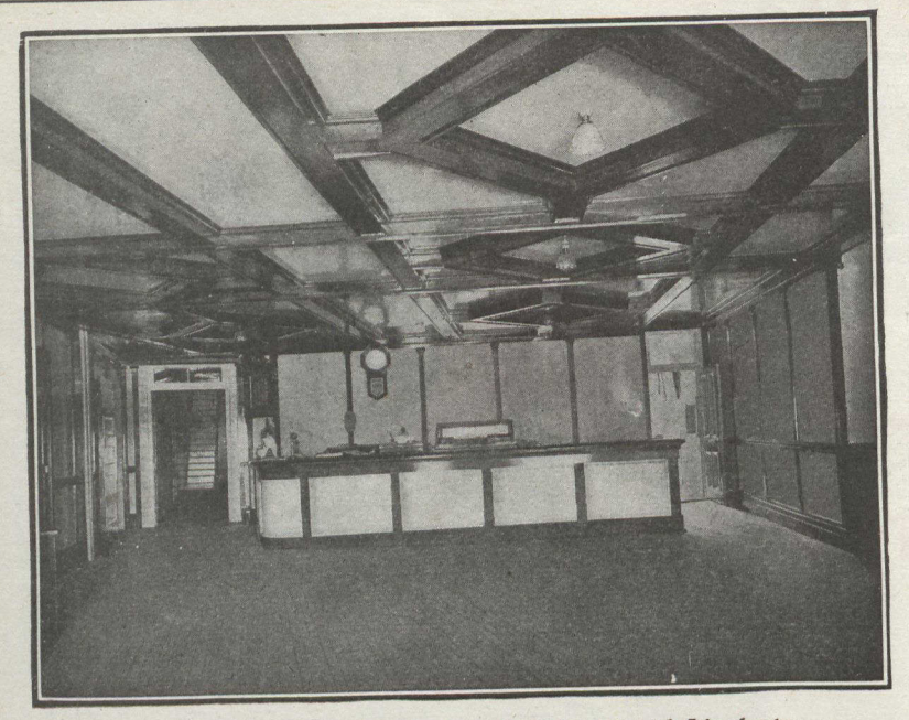
Rotunda of Larocque Hotel, Valleyfield, Lined with Linabestos.

For Walls and Ceilings of Public Buildings Hotels, Theatres, Town Halls, Schools and Churches—leading architects are specifying