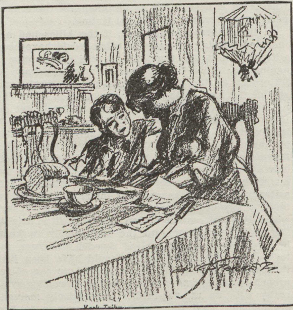
The Girl He Left Behind.

Concerning the twin question of military defence, I must content myself with mentioning two points. One is, that statesmen especially representative of the Dominions and India should be admitted to the sittings of the Imperial Defence Committee, not merely by invitation, but as a right. The other is