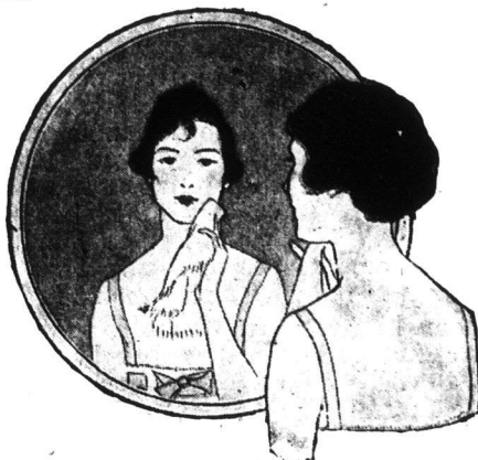
Blackheads come from improper cleansing. This treatment will keep your skin free from this annoying trouble.

treatment for a time and then neglecting it. But make it a daily habit, and it will rid your skin of ugly, embarrassing blackheads.