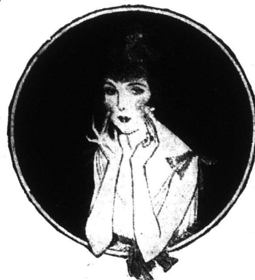
Disfiguring blemishes need the "soap cream" treatment.

We have been able to give just three treatments on this page, but you can get them all, together with many valuable facts about the skin, in this little booklet, "A skin you love to touch." For 4 cents we will send you this booklet and a cake of Woodbury's Facial Soap large enough for a week of any Woodbury treatment. Write today. Address The Andrew Jergens Co. Ltd., 2411 Sherbrooke Street, Perth, Ontario.