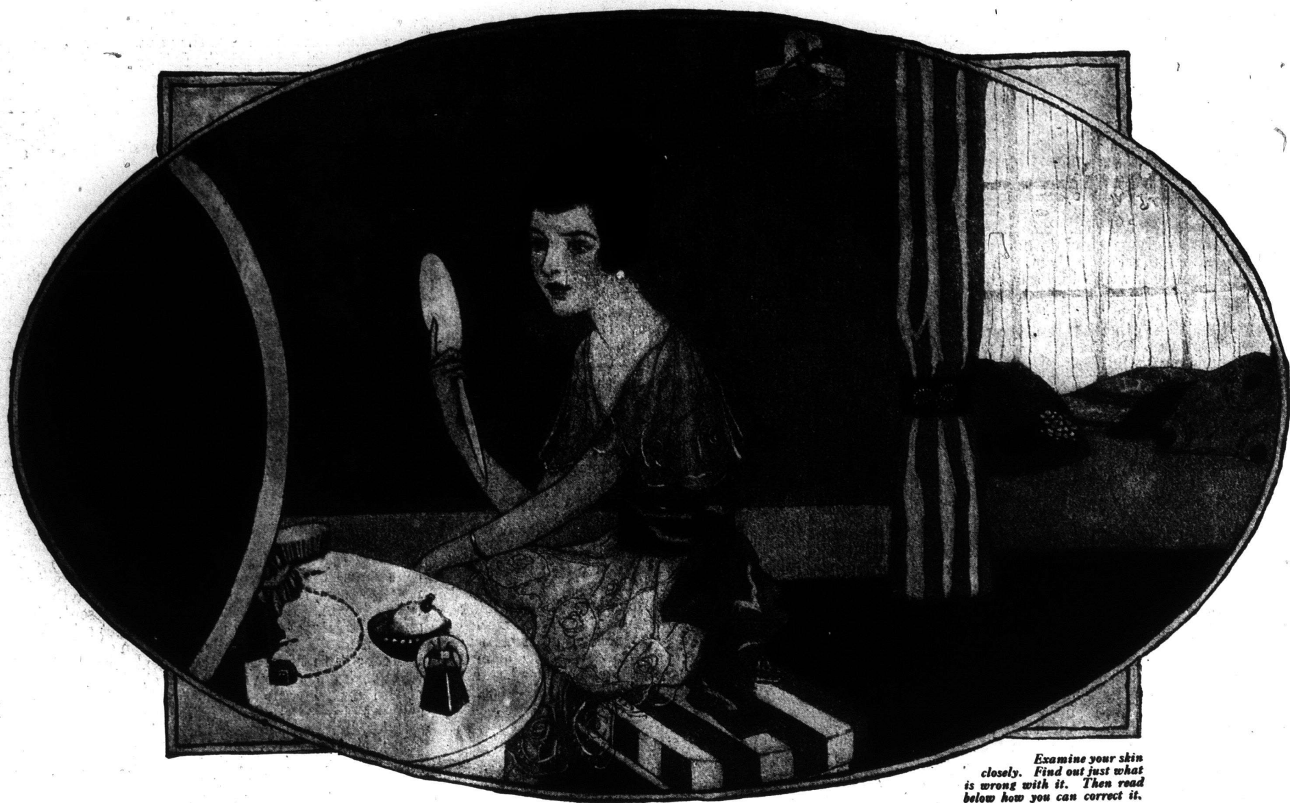
Examine your skin closely. Find out just what is wrong with it. Then read below how you can correct it.