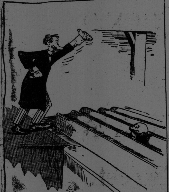
WILD SCENE AT THE CONVENTION WHEN MUTT PLACED HIS OWN NAME IN NOMINATION.