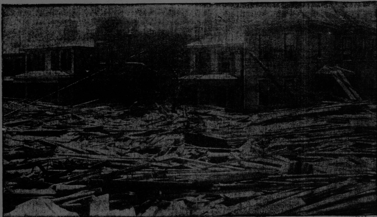
A bridge of floating timber over three feet of water in May avenue, Columbus. Over this hundreds of persons trapped in their houses, crept to safety.