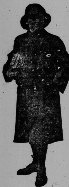
BOY'S COAT, 4 to 16 years, $4.00

Timely, practical Christmas Giving, so much in favor this year, is most happily expressed in Seasonable Wearing Apparel, of which our showing is fully abreast of demands of the day, with the outstanding features of LOW PRICES, DEPENDABLE QUALITY, LARGE ASSORTMENT.