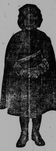
GIRL'S CAPE, 4 to 12 years, $3.25

Such gifts as these are truly practical, and will be welcomed on Christmas morn. In Style, Quality and Value our lines are absolutely dependable.