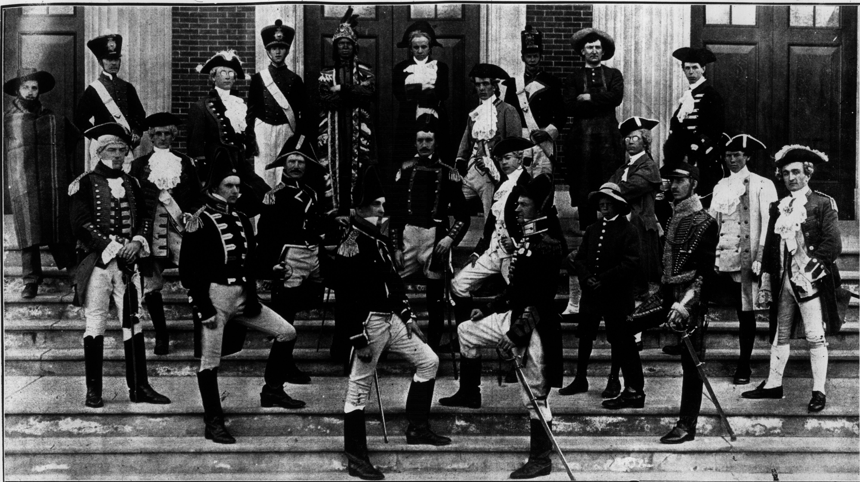
ONTARIO'S HISTORY TOLD IN PAGEANTRY.—REPRESENTATIVES OF MANY GENERATIONS RUBBED SHOULDERS IN THE QUEEN'S OWN SEMI-CENTENNIAL PAGEANT AT TORONTO, PRESENTING THE CHIEF EVENTS OF ONTARIO'S STIRRING HISTORY. SOME OF THE MEN WHO MADE CANADIAN HISTORY ARE SHOWN IN THE ABOVE GROUP.