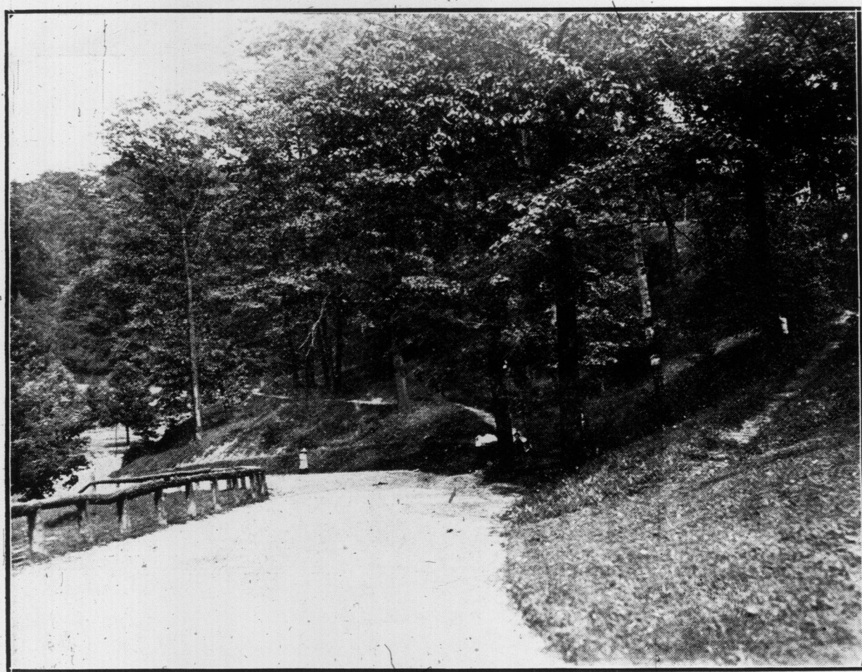
IN THE COOL SHADE OF A VERDANT HILLSIDE. An attractive spot in the Rosedale Ravine. The roads and paths wind in and out amongst the thick-set trees.