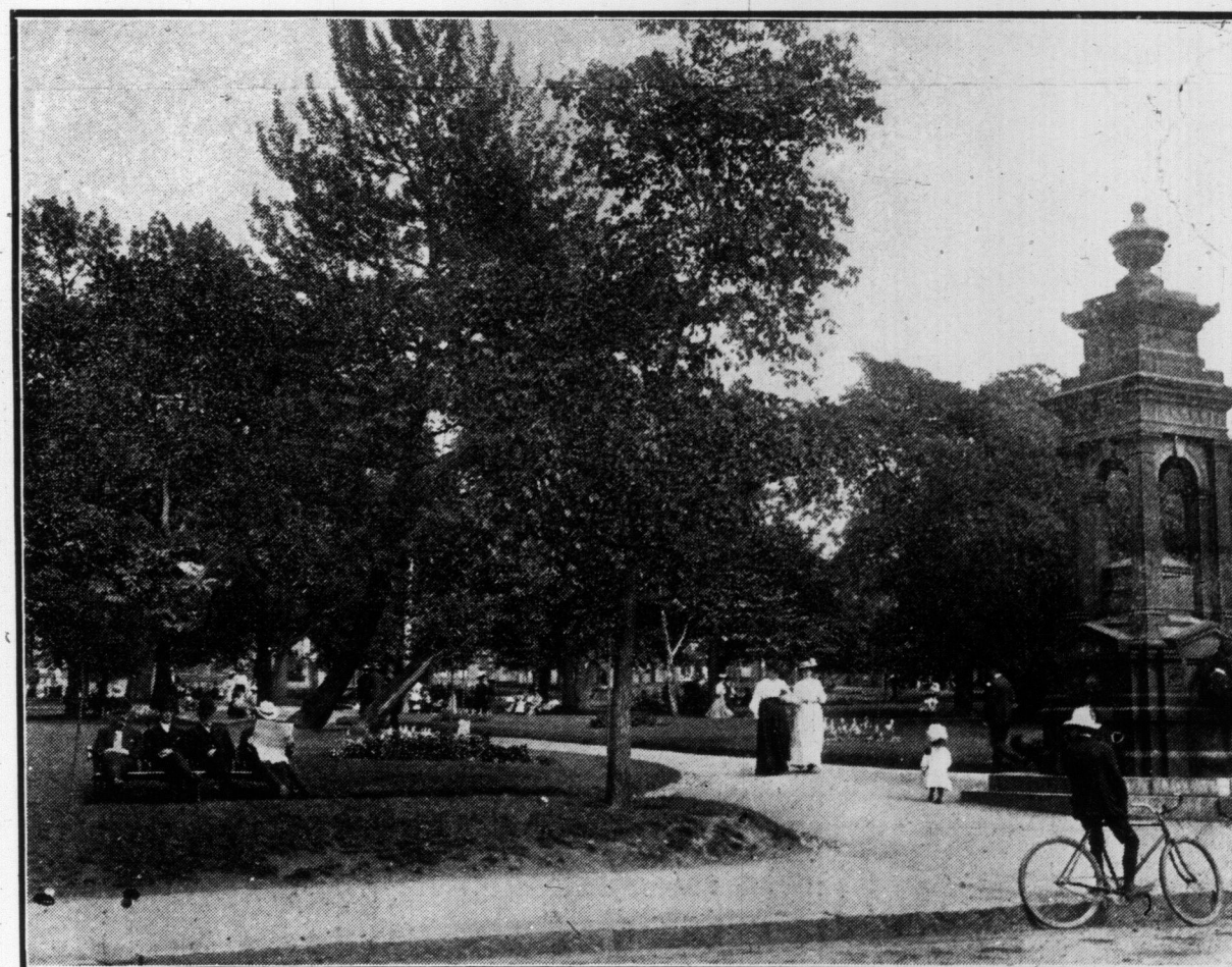
NATIONAL PORT AND BEAUTY SPOT. King Square, St. John, New Brunswick, one of the many beautiful parks and squares that are such an attractive feature of the city.