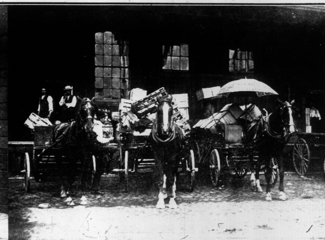
Hundreds of crates of tempting fruit are delivered to Toronto retailers every morning.