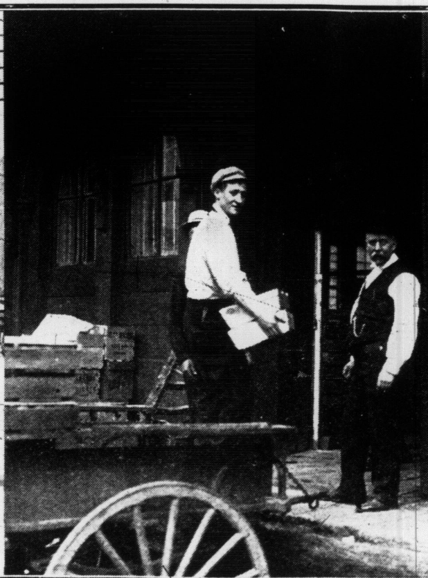
WHEN THE LUSCIOUS PRODUCE OF ONTARIO'S ORCHARDS REACHES THE CITY. Storing fruit in the big market building.