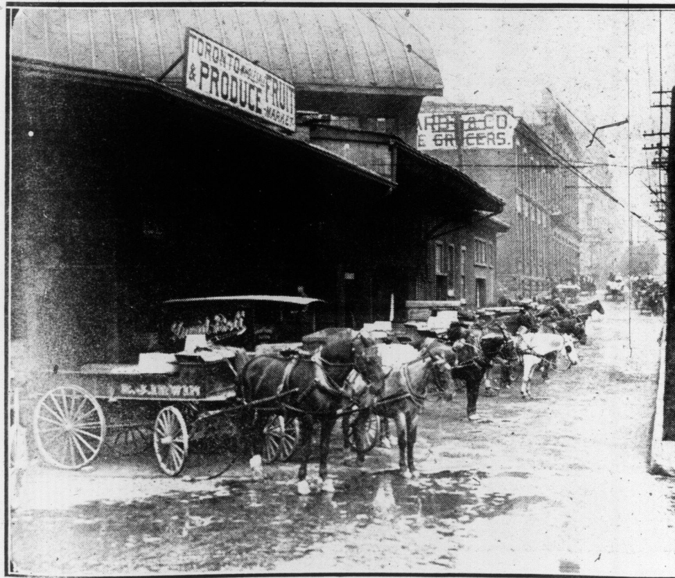
The Fruit Market at the Foot of Yonge-street.—Teams waiting to load fruit for delivery all over the city.