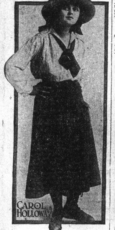
In "The Fighting Trail," at the Unique Theatre on Monday and Tuesday next.

Inc., will be shown at the Majestic Theatre Wednesday and Thursday. It is during the period of '98, when the gold mad crowds pack the little town of Hope City, Alaska. Dorothy Dalton appears as the "Flame," a harpy of the dance hall. Many thrilling episodes are enacted in the hall, where gamblers, miners and all types of men meet to try their luck with the roulette wheel. In one exciting scene, "The Flame" succeeds in breaking the bank and getting her money that her sweetheart has lost in a crooked game.