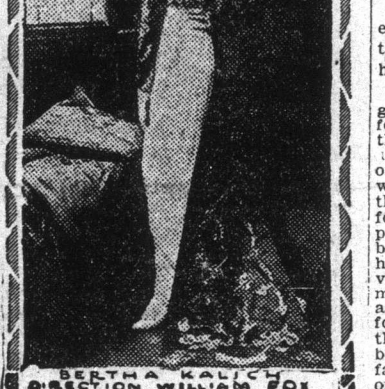
At the Unique Theatre on Monday and Tuesday in "Love and Hate."