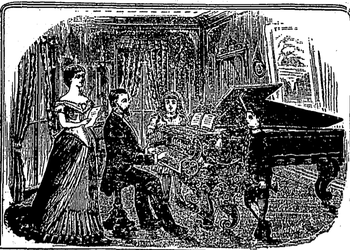
THE WEBER BABY GRAND. RECEIVED HOME.