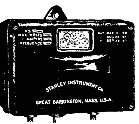
Exterior View of Meter.