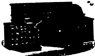
No. 51 ROTARY OFFICE DESK.