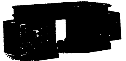
No. 50 ROTARY OFFICE DESK