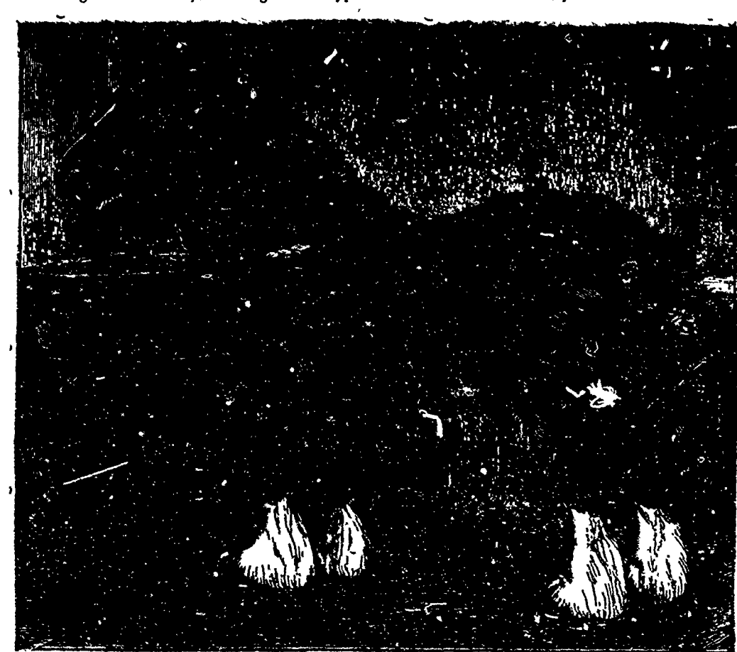
THE RENOWNED SHIRE STALLION PRINCE WILLIAM (8756), Winner of the Queen's Gold Medal, 1889, and many other champion prizes.

of a famous prize winning mare, Kelpie (2034), also