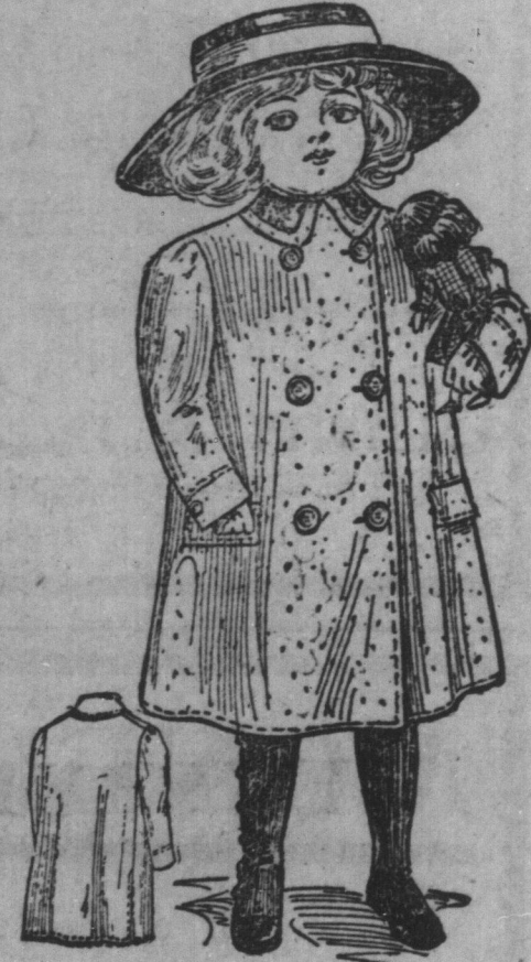
CHILD'S DOUBLE BREASTED COAT.

A part is suggested if not made in the fashionable coiffure. When one