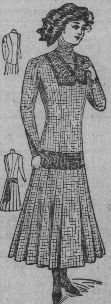
MISSIE'S PRINCESS DRESS.

An idea of the moment is to work the initials on handkerchiefs in cross stitch, and good effects may be obtained.