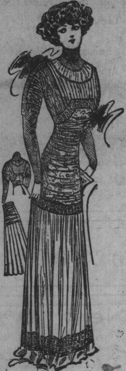
A MODISH FROCK.

A favorite small hat has an upturned brim which flares out and up at the