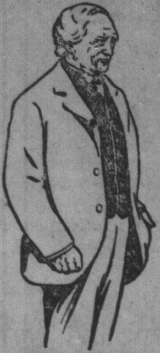
Vigorous health at 70 due to Dr. Morse's Indian Root Pills.

Dr. Morse's Indian Root Pills Purify the Blood and Prolong Life