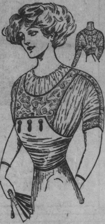
FANCY EVENING WAIST.

Red, the season's color, brightens hats and frocks that are beginning to