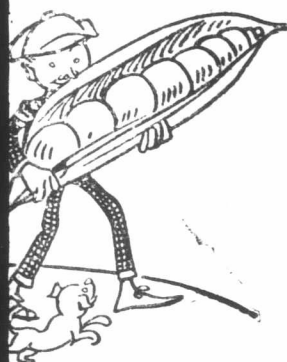
what this fellow and every 5,000,000 war gardeners in the United States is doing, says the War Garden Commission, of

or Military apparently under the within Class