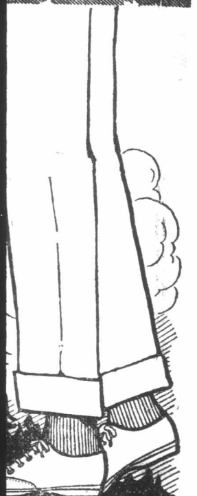
LONG THE ENEMY