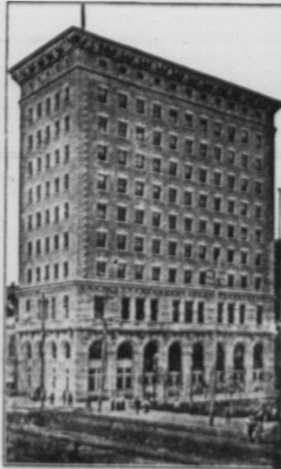
Union Bank Building, Winnipeg