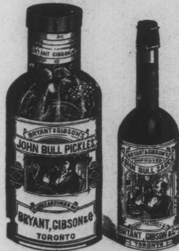
This is a facsimile of our bottles.

BRYANT, GIBSON & Co., TORONTO, Manufacturers of