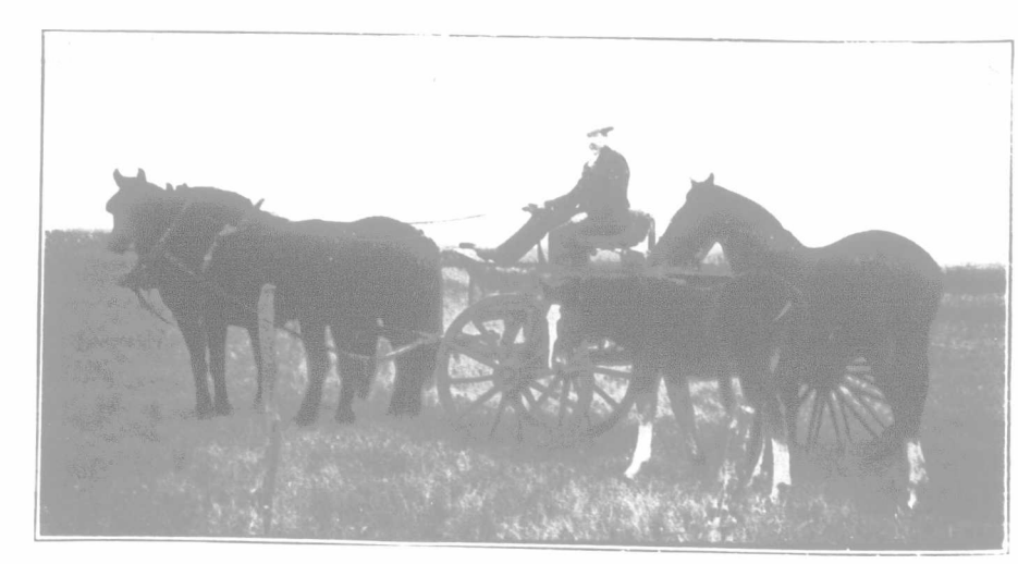
violin, flute and piano, violin, flute, to others with less experience. In STARTING FOR HOME FROM MEADOW LEA SHOW. JAS. CARR WON FIRST ON TEAM, BROOD MARE, TWO-YEAR-OLD AND FOAL.

In a small neighborhood, or even among the members of a family, it is not a hard matter to develop two-part singing. With a very little material at trained to read the parts in any usual Some fine combinations can be made composition. There is usually someone The trombone plays exactly lies in recognizing the position of the with the rest of the brass instruments, or chord line, and knowing the sound include the most competent and dis- get to give you a rubber blanket?"