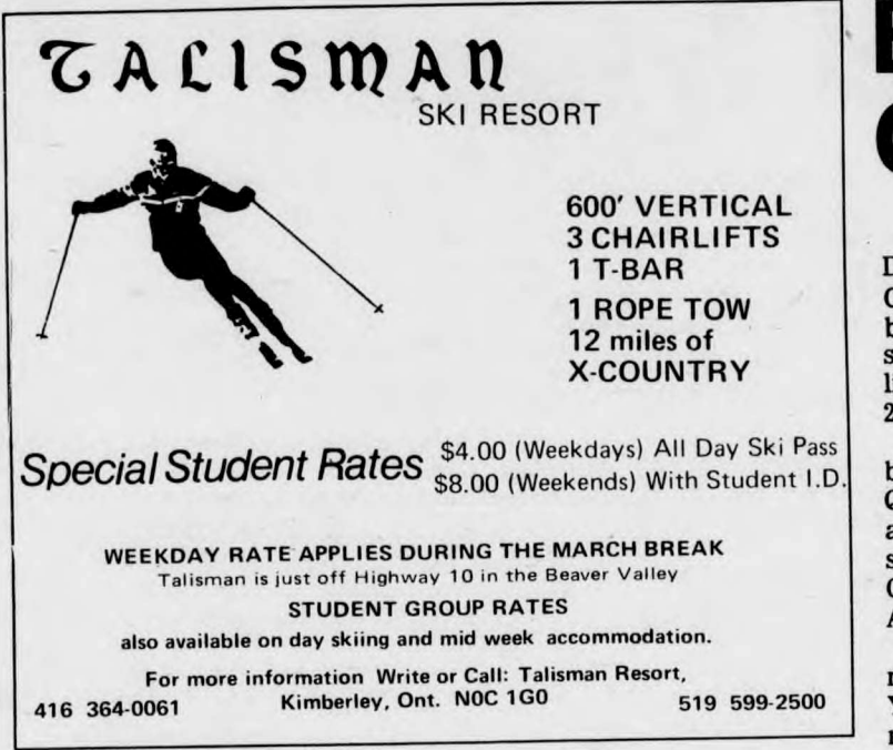
12 Excalibur, March 10, 1977