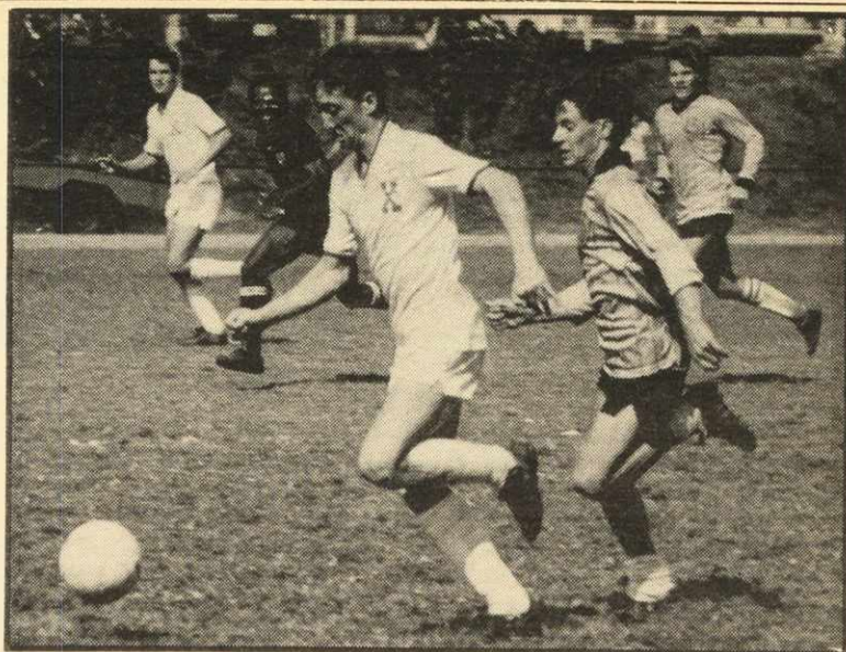
Dalhousie Tigers men's soccer team lost an important game to St. Francis Xavier X-Men by a slim 1-0 score Saturday at Studley Field.

"The team knew this was a big game and when we were down one nothing we made a couple of