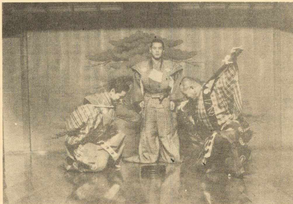
The National Comic Theatre of Japan "Kyogen" comes to Dalhousie for one performance in the Rebecca Cohn Auditorium, Friday, April 4 8:30 p.m.

common cause, they present delightful contrasts in the manner and matter of performance. "Kyogen" presents a wide range of characters from gods and demons to lords and gentlemen of high estate, from brides and bride-grooms to woodcutters and trappers, swindlers and quacks and especially servants, caught up in the games people play. The situations are often exaggerated, even improbable. Wonderfully funny, irresistible, effervescent, impudent and irreverent, thoughtful and poignant, are all accurate words to describe this historic form of theatre. "Kyogen is daring in its treatment of materials, a marvel in the art of pantomime and warm and compassionate in its commentary on the human condition.