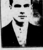
Portrait of a student who is part of the dramatic club.

The Dramatic Club will present a play in the hall in March. The play is called 'The Brunswickan' and is being performed in the hall in March. The play is called 'The Brunswickan' and is being performed in the hall in March.