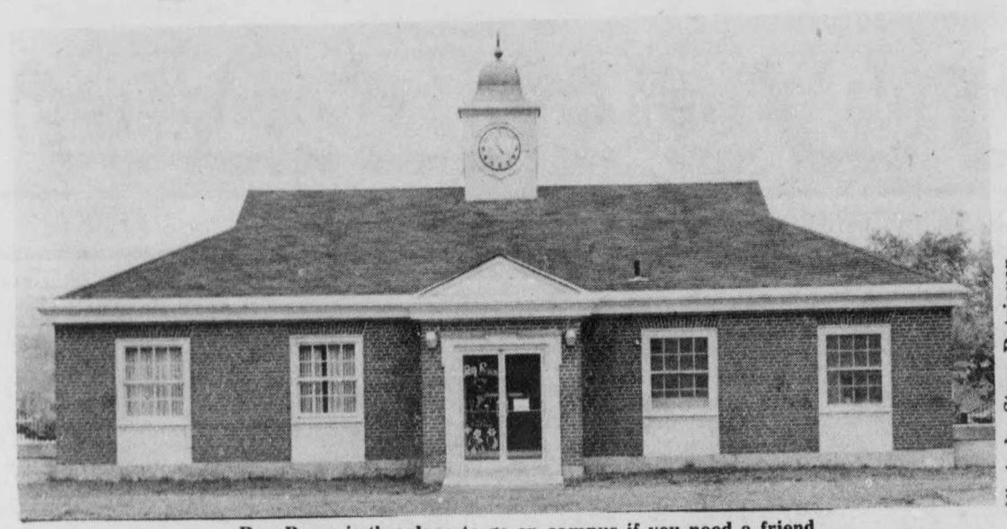
Rap Room is the place to go on campus if you need a friend.