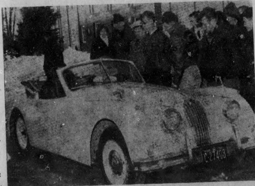
DOES IT REALLY RUN ON MOOSEHEAD?

Once again, we suggest that you get down to pool early for a good seat and to cheer our teams on to a Winter Carnival victory over the Mount A. contingent.