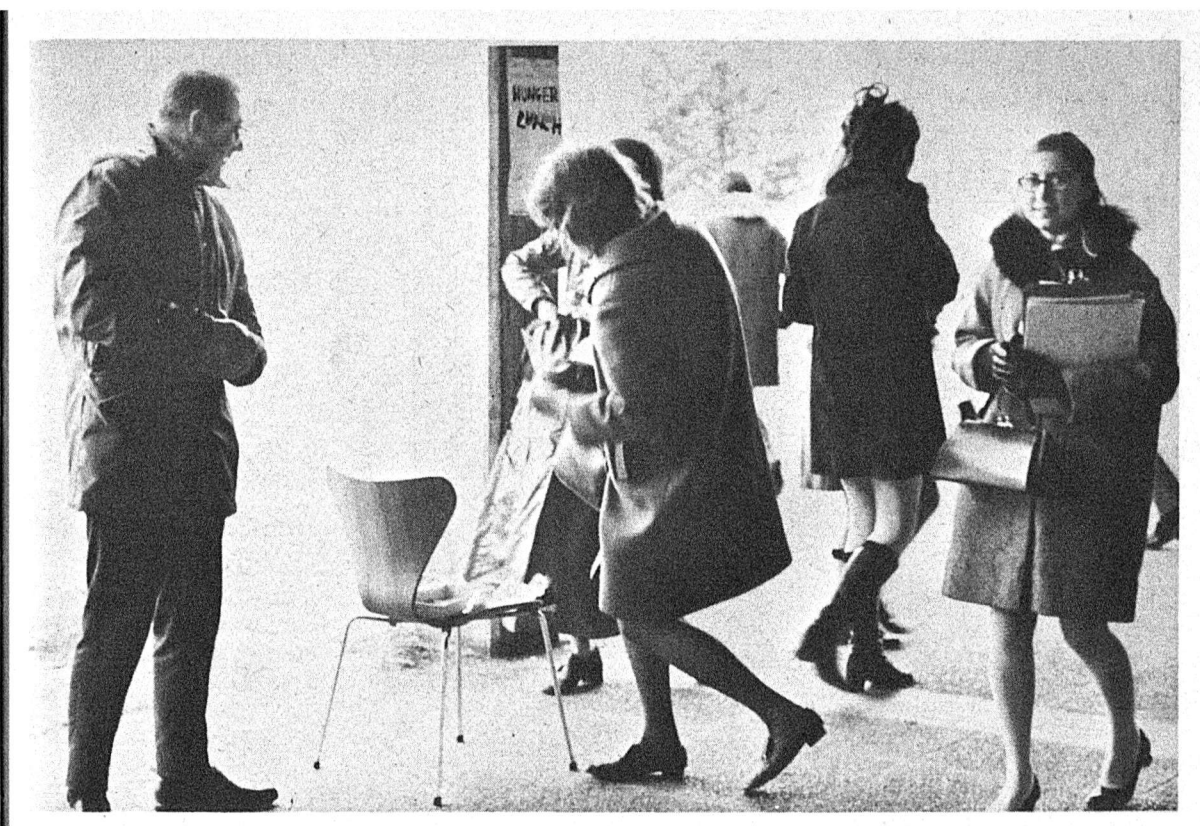
BE A LITTLE HUNGRY for one lunch to help feed some needy children. At least some people care, as there was a large turnout yesterday for Hunger Lunch. Here, for a coin, you receive some bread and cheese. All monies collected are given to the Canadian Save the