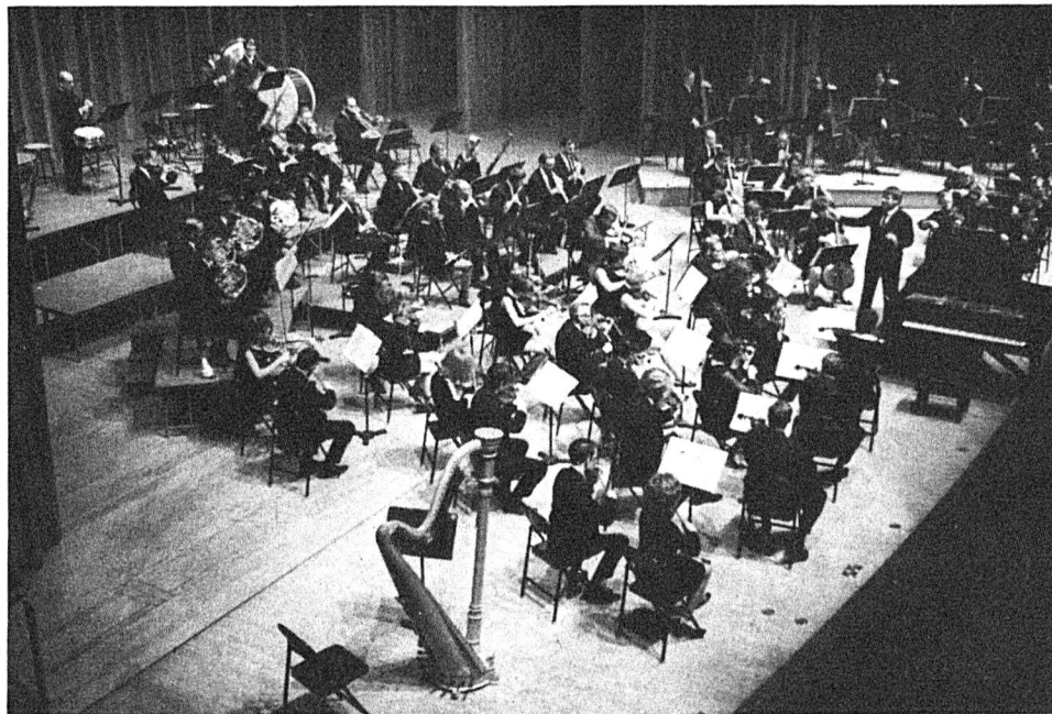
SCHEHEREZADE BROUGHT TEARS TO THE EYES ... of a cold, hard cynic