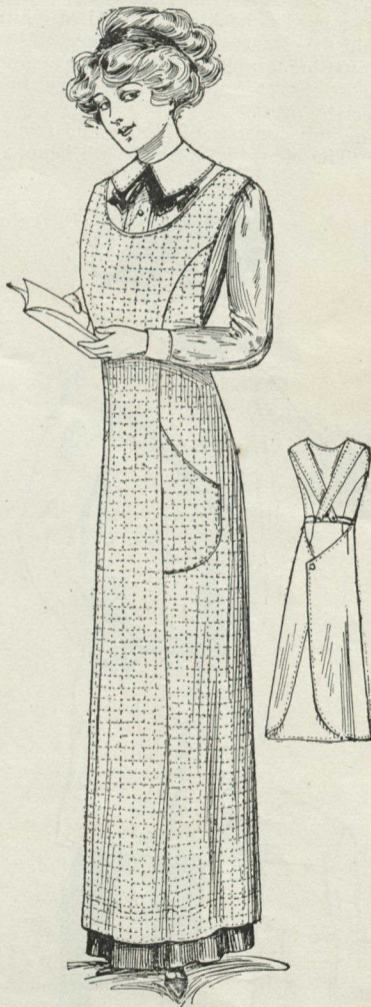
Apron Pattern No. 6952

The quantity of material required for the medium size is 4 yards 27, 3\frac{3}{4} yards