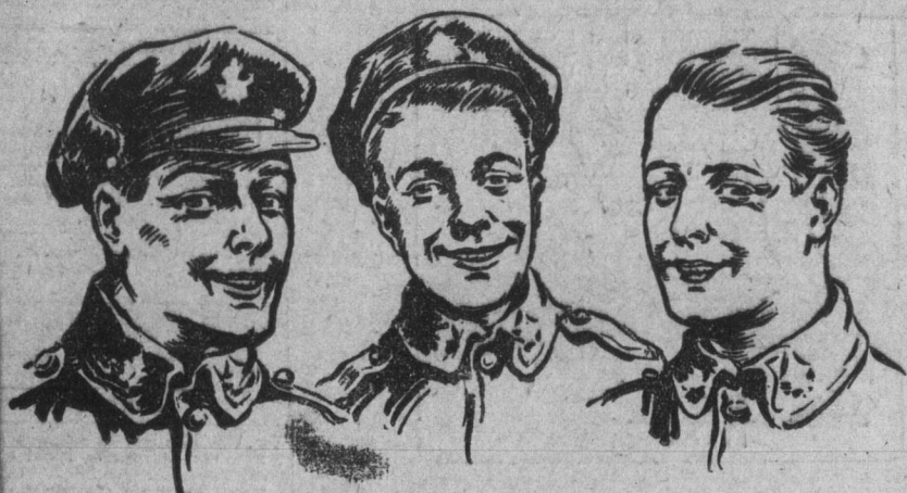
Keep Them Smiling

Three White Plymouth skereels, including 1st cockerel terloo show, also second Waterloo, and several year- na. Call at Huchner's Store, 46 Foundry Street Kitchener, in the evening. f taken at once. 1-17-1t.