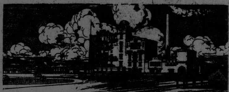
THE FRONTENAC BREWERIES, MONTREAL.

From the time that the appetizing malt and fragrant smelling hops are put into the huge copper brewing kettles, to the time FRONTENAC BEER is offered to you, sparkling and delicious, every care is taken to maintain its purity and preserve its reputation as the best beer brewed in Canada today. It is made by the highest paid brewery workers in the Dominion, under the supervision of a Master Brewer of international reputation. The brewery itself is fitted with the most up-to-date appliances and machinery ever got together in this country.