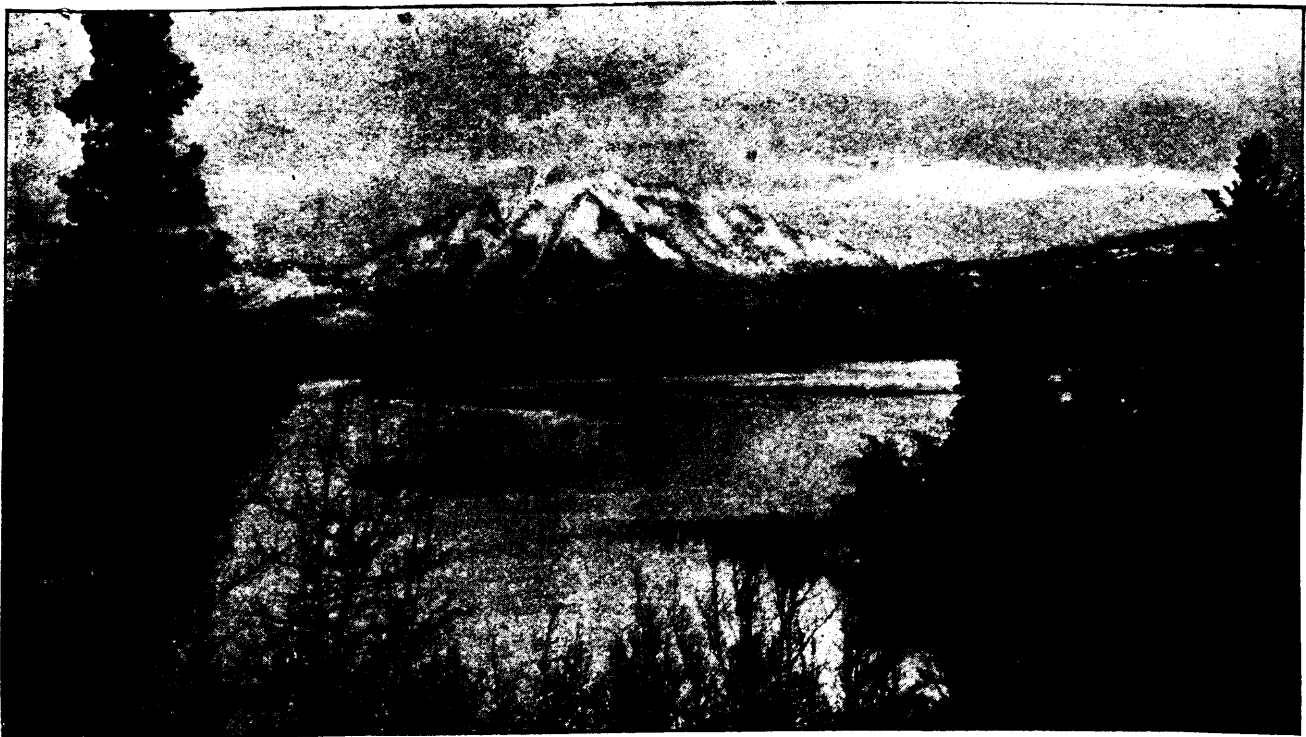
CROWS' NEST PASS AND TURTLE MOUNTAIN.