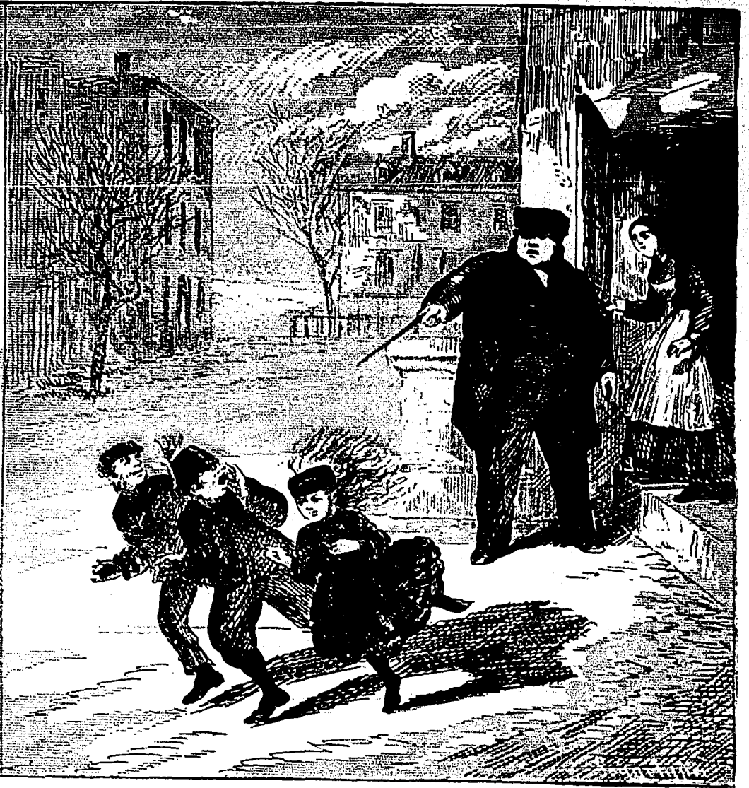
"Eh—h. April Fool!"

GRANT'S SKIN PRESERVER. BEAUTIFUL FOR EVER.—For sale at all Drug Stores. Price 25 cents. ELLIOT'S DENTIFRICE.—"THE BEST IN USE."—The verdict of 30 years' trial. All Druggists sell it