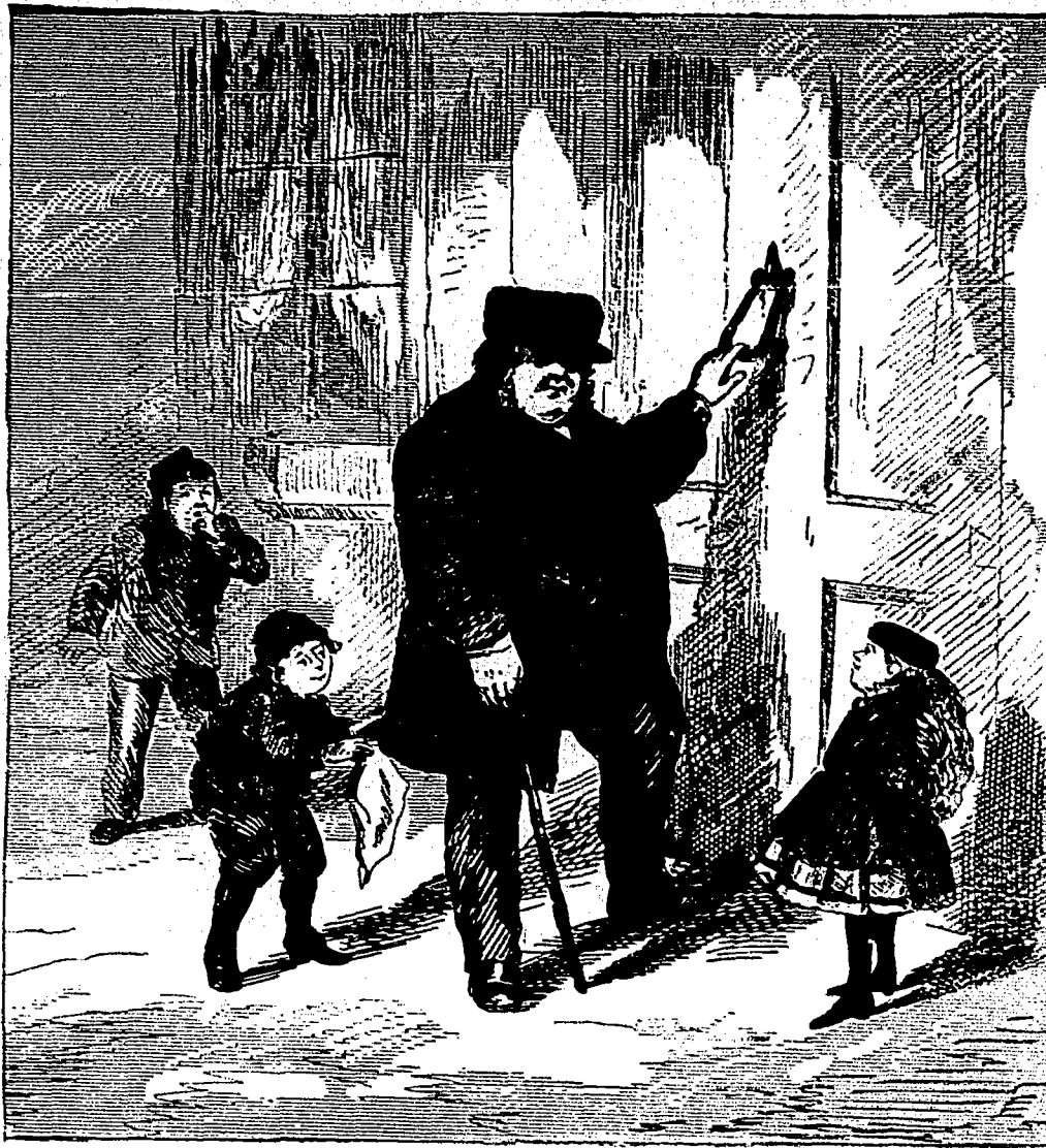
"Please, Sir, will you knock at the door, and knock hard Sir, please, mother's deaf."