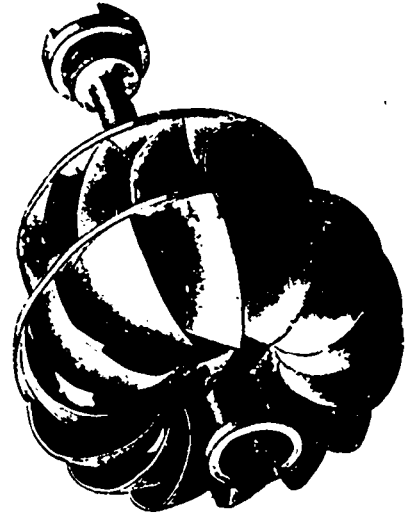
Cut Showing Wheel Removed from Case

Made in sizes from 6 inches to 84 inches diameter. Wheel One Solid Casting. 84 per cent of power guaranteed In Five Pieces. Includes whole of case, either register or cylinder gate.