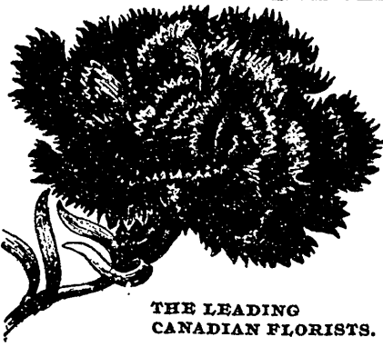
THE LEADING CANADIAN FLORISTS.