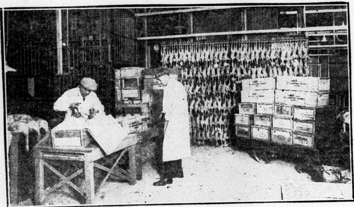
"'FOWL' IS FAIR," wrote Shakespeare. The modern bard, visiting the St. Lawrence market, where birds, these days, are packed by the hundreds, would probably describe it as the 'Flair for Fowl'.