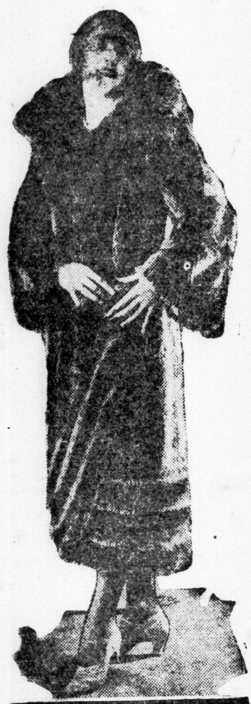
HERE IS something stylish, yet ruggedly serviceable, for the most strenuous wear for the business or college girl. A full length coat of Russian bearskin.