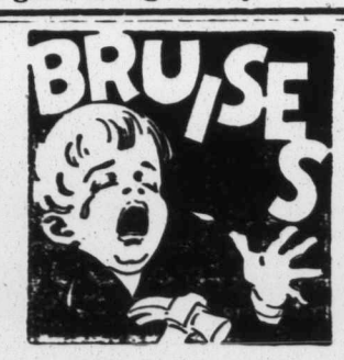
Apply Minard's at once. It halts the pain and stops inflam-mation. Removes all poison from cuts and sore Keep a bottle on the shelf.