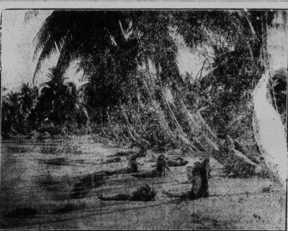
ENCHANTING MERMAID COVE IN WILLIAM FOX'S MILLION DOLLAR PICTURE BEAUTIFUL. DAUGHTER OF THE GODE, COMING TO THE HAPPY HOUR ON THURSDAY, JULY 4TH.