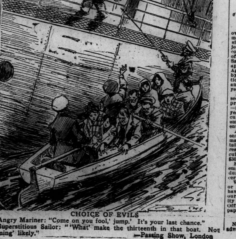
CHOICE OF EVILS Angry Mariner: "Come on you fool, jump." It's your last chance. Superstitious Sailor: "What make the thirteenth in that boat. Not blooming likely!"