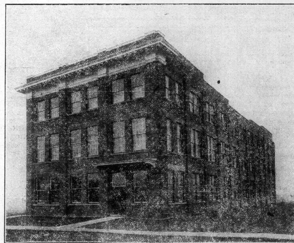
Building of the Niagara Silk Company, Limited

Rome, Nov. 10.—Via Paris, Nov. 11.—Despite denials that Prince von Buelow is in Switzerland on a peace mission, or that the Vatican is taking any part in preliminary peace negotiations, a Zurich dispatch to The Messenger, asserts that the former German Chancellor, has had a long interview with Father Ledochowski, general of the Society of Jesus, known as the "black pope," who came to Lucerne at the request of Prince von Buelow. The two men are said to have been in conference several hours after which the Jesuit leader sent a long report to the Pope.