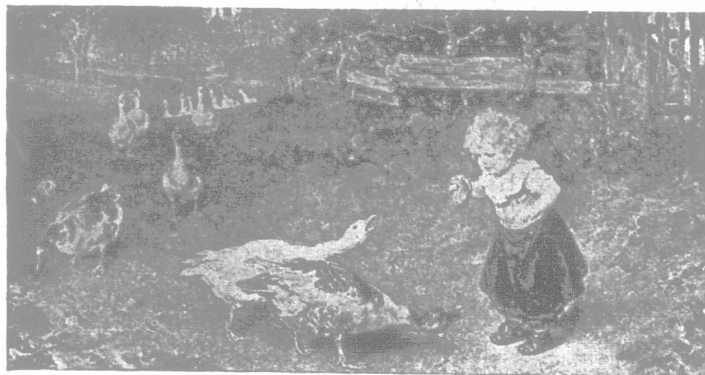
A Perilous Path.

I don't suppose there is, in this whole universe, one unjust law or action which, if held up to the public gaze, would not at once win to itself numbers of supporters—people who would declare that no injustice existed, or, if it did,