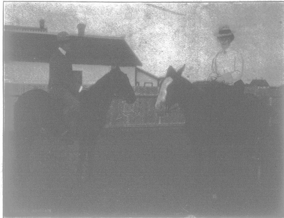
READY FOR A CANTER, CALGARY, ALBERTA.