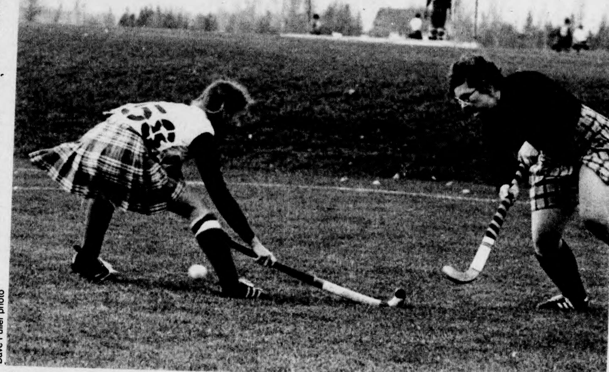
York Yeowoman (58) battles with opponent over white ball with funny curved hockey sticks. The game is field hockey and York finished fourth in the eight-university meet.

In the intermediate level of the tournament, York's squad placed