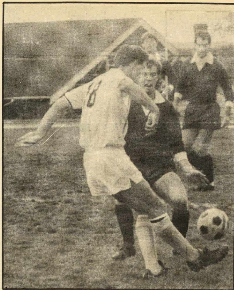
Dalhousie's men's soccer team has now been eliminated from any hopes. However, the team continues to play hard.

There's a new sign of quality at your favourite establishment. It says Alexander Keith's Draught is on tap. Now it's easy to see where those who like it, like it a lot.